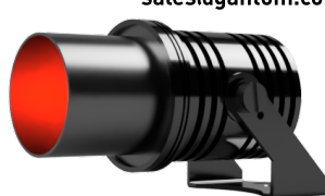
Shown with optional FA44- Top Hat