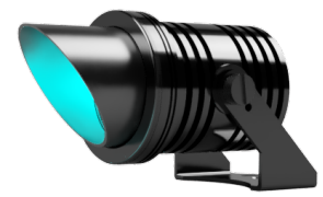
Shown with optional FA46 - Angled Cowling