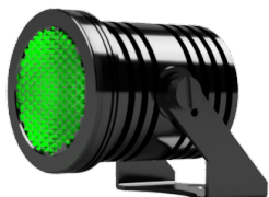
Shown with included Hex Filter

Gantom 7 is backed by Gantom's two year warranty. Special orders and Stucchi track options available. Please contact Gantom at sales@gantom.com for more information.