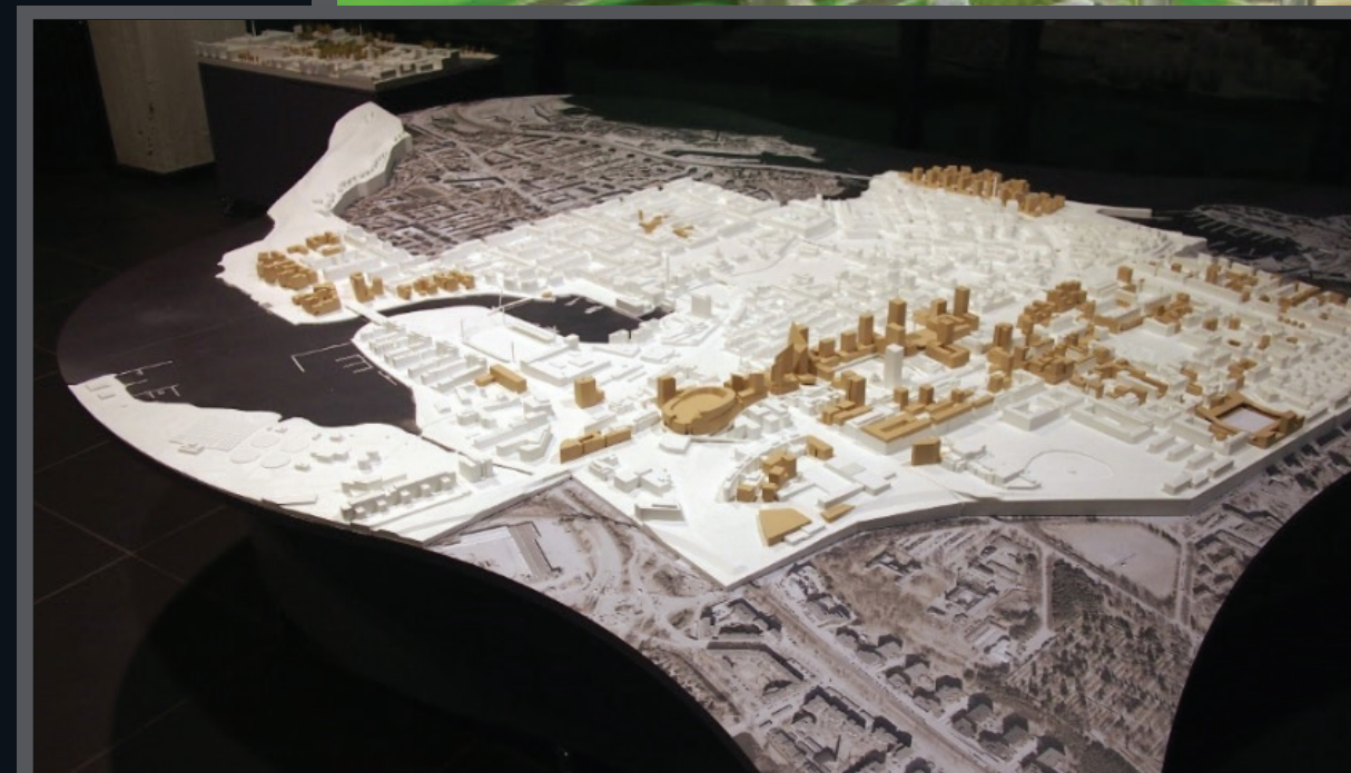
Energy City, Houston Museum